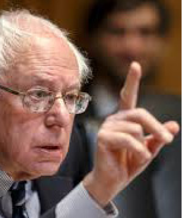
Bernie Sanders

political action but are unsure of what to stand for should seriously consider Senator Sanders. His plat form consists of numerous Progressive values, but there is one major idea to take from what he preaches. This is for promoting the general welfare and caring about every American.